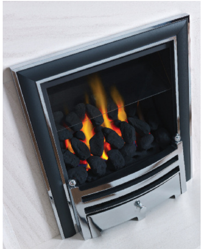
Paragon P3 Hybrid Elite Trim & Gate Fret in Chrome