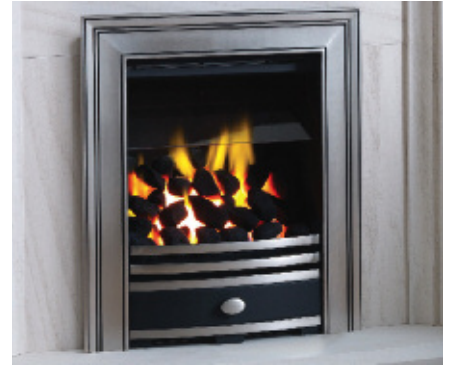
Paragon P3 Hybrid with Square fascia in pewter