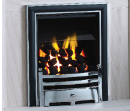
Paragon P3 Hybrid Elite trim & Gate fret in chrome