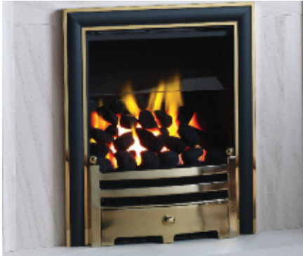
Paragon P3 Hybrid Elite trim & Gate tret in brass

The Paragon P3 Hybrid Series is a natural gas, manual control, convector gas fire combining the performance of a highly-efficient glass-fronted fire with the charm of an open-flame gas fire.