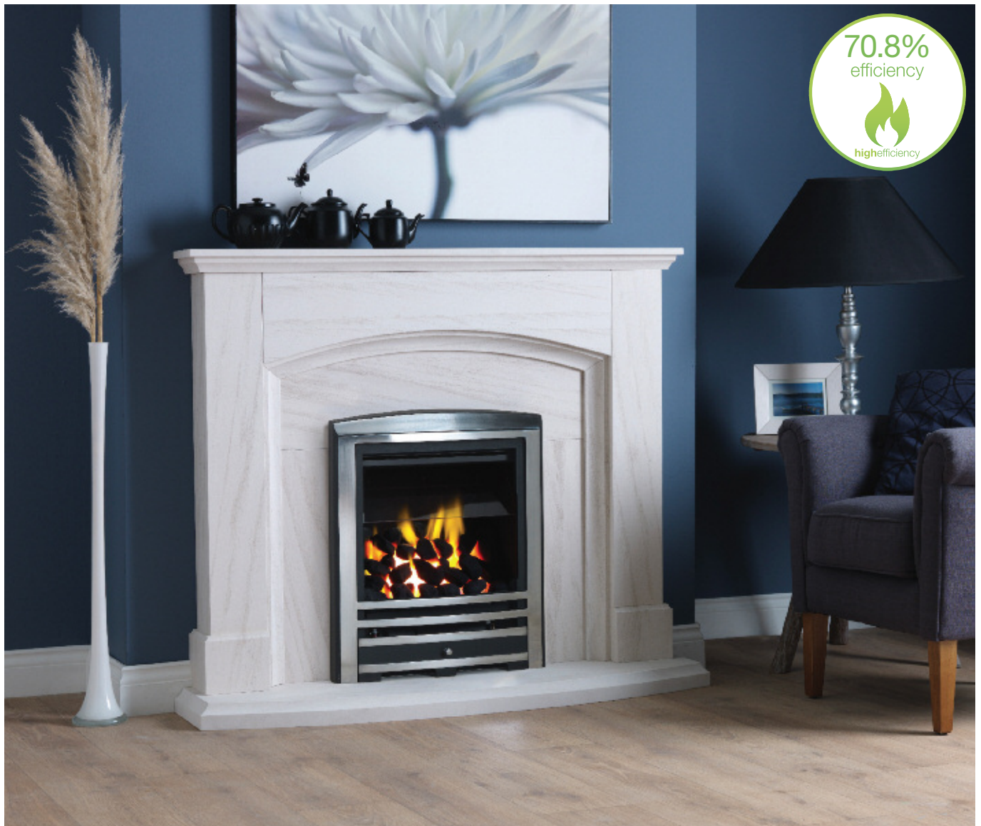
Paragon P3 Hybrid with Cast Arch fascia in chrome

For specifications refer to the technical datasheet